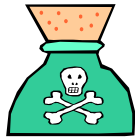
Poison Control Center