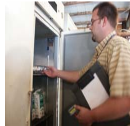
Checking temperature in a cooler

◇ Cold holding options include: freezers, refrigerated trucks, cooler with dry ice