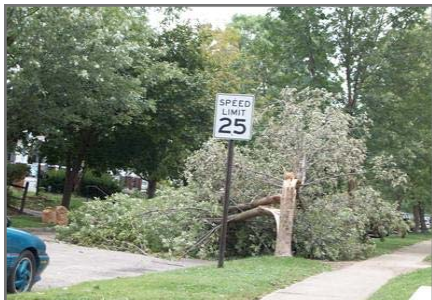
September 2008 wind storm damage in Ohio