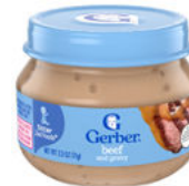
Beef & Gravy

Available t exclusively breastfeeding participants only; Gerber brand second foods only; 2.5-ounce glass jars only; Only the specific types as listed below: