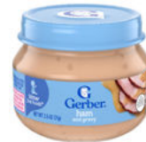
Ham & Gravy