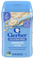
Gluten Free Oatmeal Cereal

NOT ALLOWED: With added fruit; with added DHA/ARA; cereal in jars; variety packs.