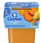
Sweet Potato Corn