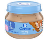
Turkey & Gravy