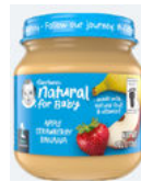
Apple Strawberry Banana

Gerber brand 2nd Foods only; 4-ounce glass containers only. Only the specific types as listed below: