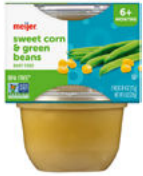
Corn Green Beans