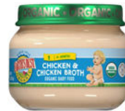
Chicken & Chicken Broth

For exclusively breastfeeding participants only Earth's Best Organic brand; 2.5-ounce glass jars only; Only the specific types as listed below: