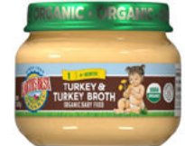
Turkey & Turkey Broth