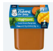
Sweet Potato Mango Kale