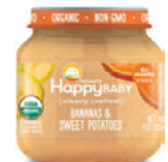
Bananas & Strawberries