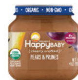
Pears & Prunes