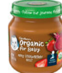
Apple Strawberry Beet