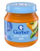
Pear Carrot Pea