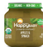
Apples & Spinach