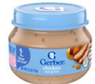
Chicken & Gravy