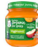
Sweet Potato Apple Carrot Cinnamon