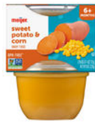
Sweet Potato Corn