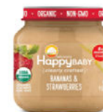
Bananas & Strawberries