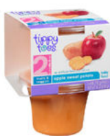
Apple Sweet Potato