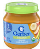
Mango Apple Banana