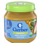
Apple Spinach Kale