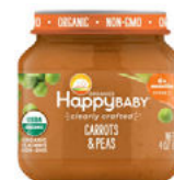
Carrots & Peas