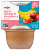
Apple Banana Strawberry

Meijer brand foods only; 2-4-ounce plastic twin-pack; Only the specific types as listed: