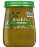
Spinach Zucchini Peas