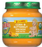
Corn Butternut Squash